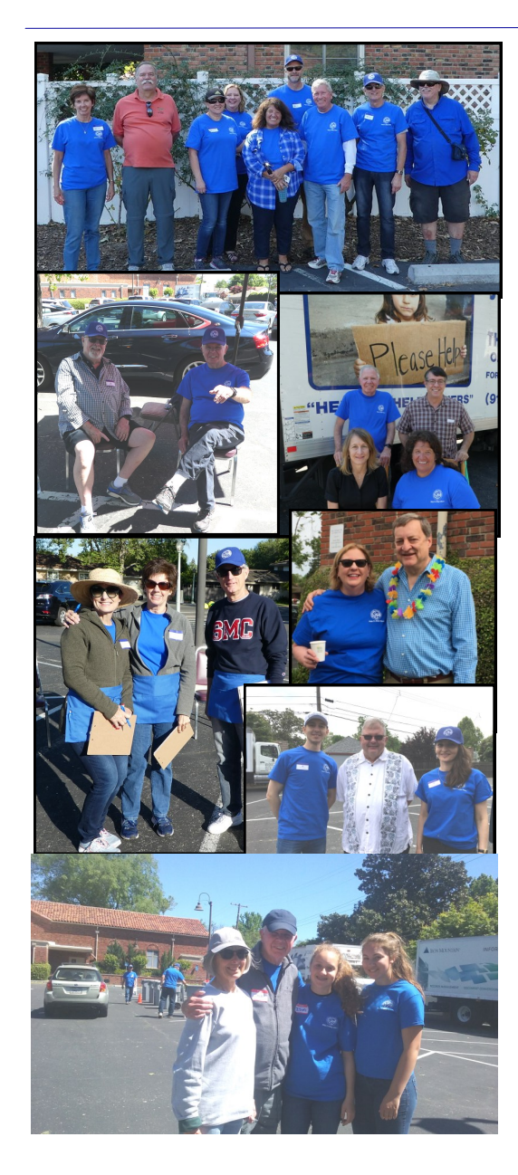
Our faithful HS SVdP Conference Volunteers in action!